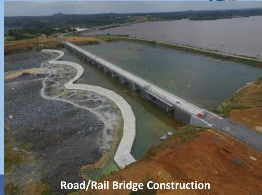
Road/Rail Bridge Construction