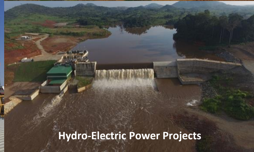
Hydro-Electric Power Projects